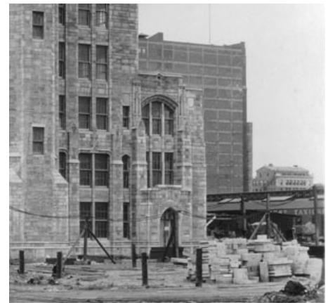
Ward Clinic Under construction, 1926