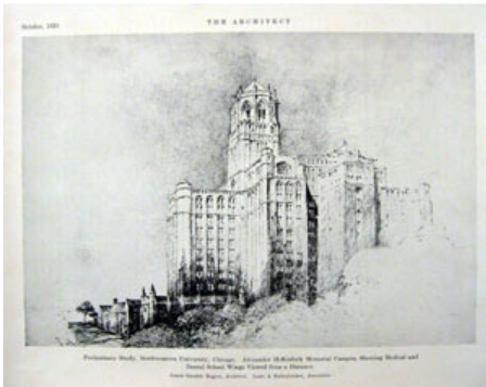
James Gamble Rogers' proposed design for the new Chicago medical campus

Northwestern University's professional schools—Medical, Law, Commerce, Dental, and Pharmacy—were originally founded as separate schools and scattered in various locations throughout the city of Chicago. In 1902, with the exception of the Medical School, the schools were consolidated in a single Loop location in the Northwestern University Building (formerly the Tremont House) at Dearborn and Lake Streets. In 1915, the University began a search for a new campus that could accommodate all the schools in their own specialized buildings in one central location.