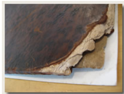
Board corners were considerable damaged.