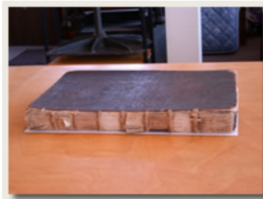
Cowper's Anatomia needed a little work. The spine covering was entirely missing.

Viewing the library's historical and rare books is by appointment only. Please call (312) 503-8133 or email for an appointment with the Special Collections Librarian.