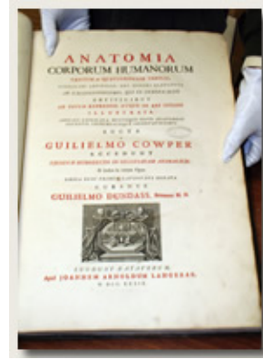
The Anatomia has a new lease on life!